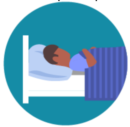
Stay home if you're sick

• Stay home if you are sick, except to get medical care. Learn what to do if you are sick.