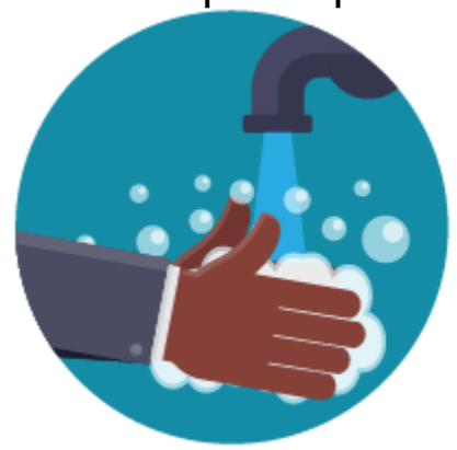
Clean your hands often