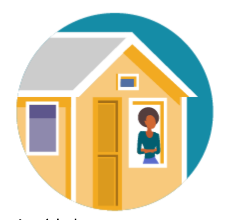
Avoid close contact