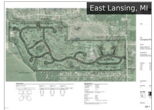
2874 E. Lake Lansing Rd. Subject To Offer