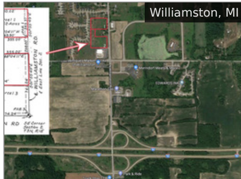
3055 N Williamston Road Off Market