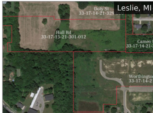
404 Worthington Place Dr $3,000 - $69,125