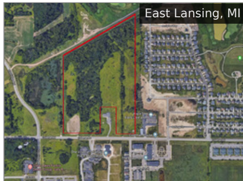
Coleman Rd. $4,500,000