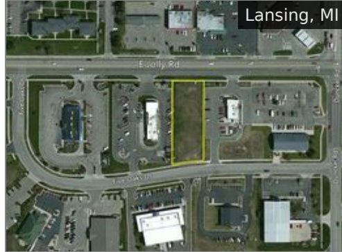
Jolly Rd $199,900