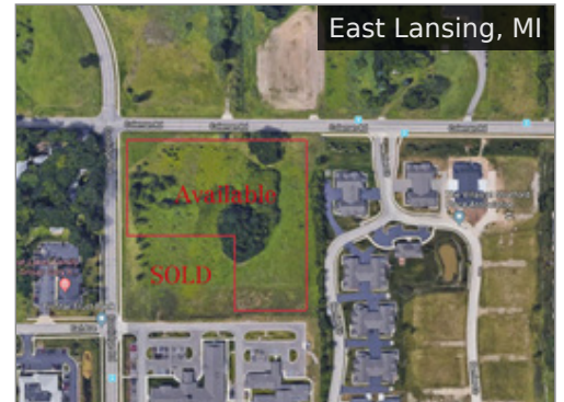
Coleman Rd. $1,600,000