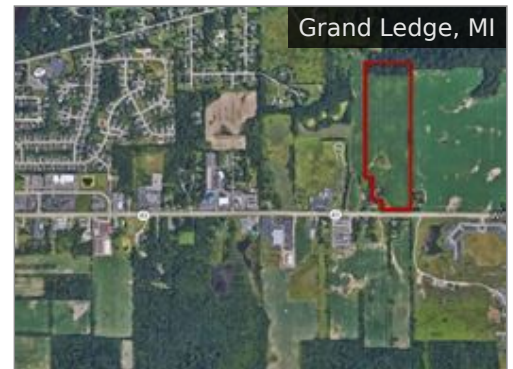
Grand Ledge, MI