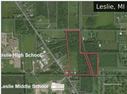
503 N Main St $129,900