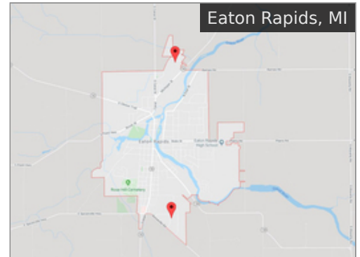
Eaton Rapids, MI