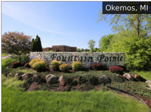
0.835 - 22 Acres, Atrium Drive $145,490.41 - $546,678