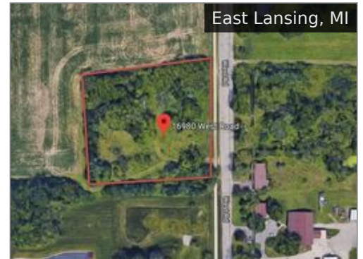
16980 West Rd $315,000