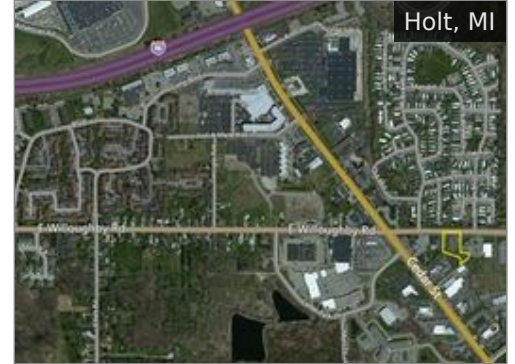
Willoughby Rd $54,900