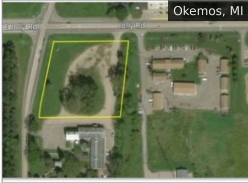
Corner of Jolly and Hagadorn $420,000