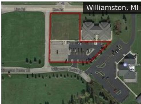
201 Williamston Center Rd $495,000