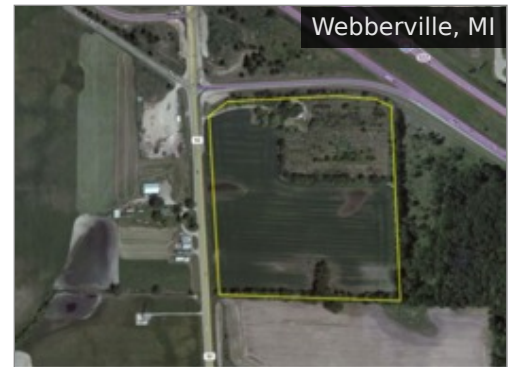
2416 N M-52 $886,200