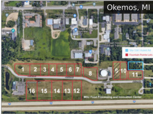
3381 Hulett Rd $157,000