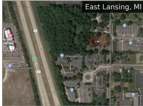
3305 West Road $155,000