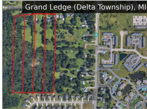
Grand Ledge (Delta Township), MI