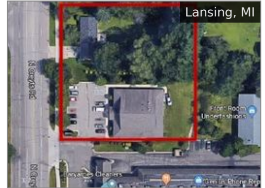
722 & 732 N Creyts Road $289,000