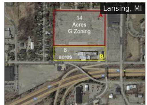
2400 W St. Joseph St. $1,390,000