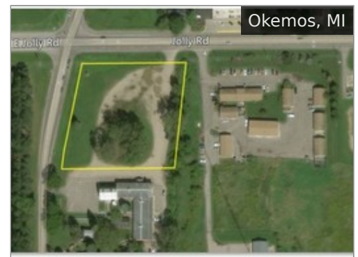
Corner of Jolly and Hagadorn $385,000