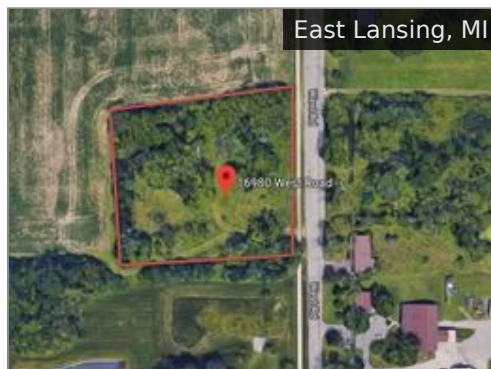
16980 West Rd $315,000