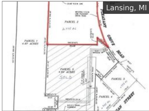
2600 W Miller Rd $199,000