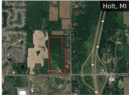
47.2 Acres at Holt Rd & College $1,395,000