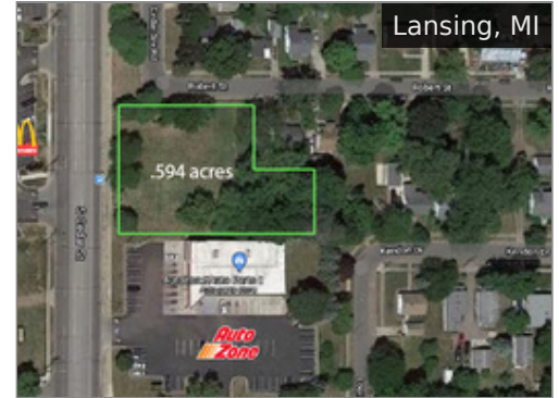
S. Cedar Street $124,900