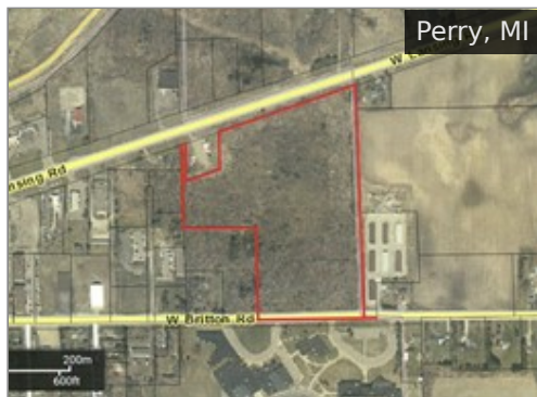
22.7 Acres $425,000