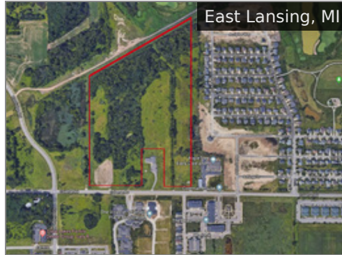
East Lansing, MI