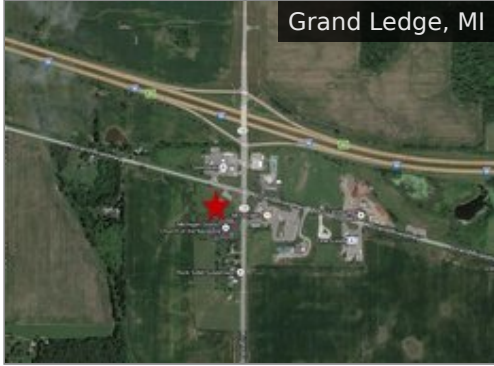
Grand River Ave & M-100 $450,000