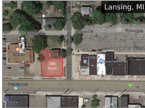
1000 W Saginaw Street $50,000