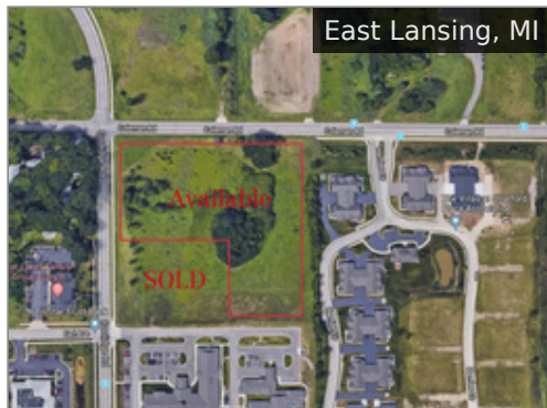
East Lansing, MI

3055 N Williamston Road $395,000 - $495,000