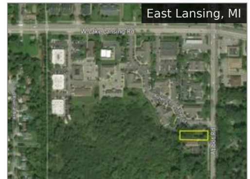
East Lansing, MI