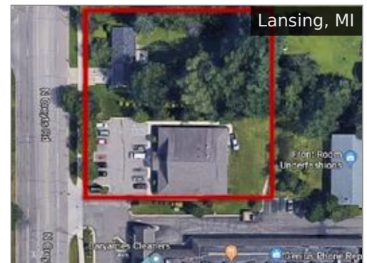
722 & 732 N Creyts Road $289,000