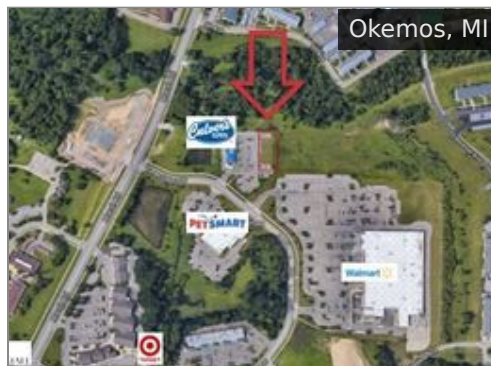
5140 Times Square Drive 6,000 SF for Lease