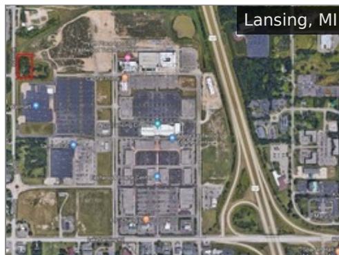
3318 Wood St. $140,000