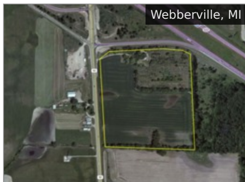
2416 N M-52 $886,200