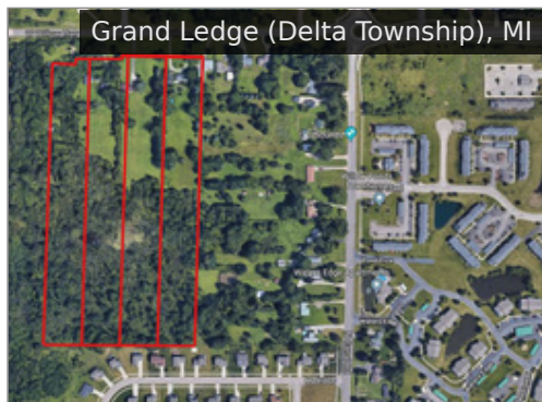
7819 W. Willow Highway $1,400,000