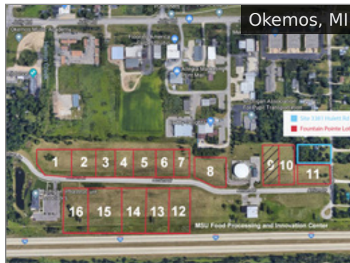
3381 Hulett Rd $157,000