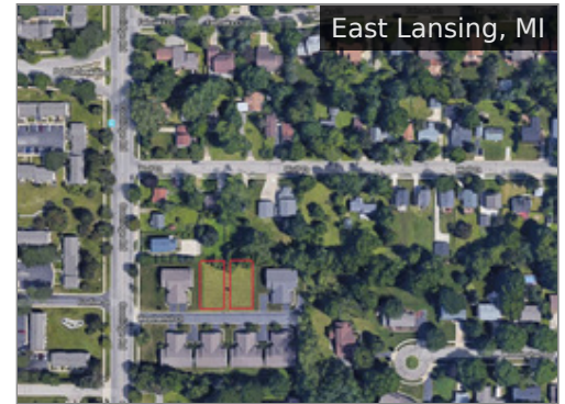
1418 Weatherhill Ct $45,000