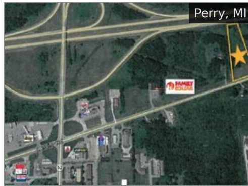
Lansing Rd $110,000