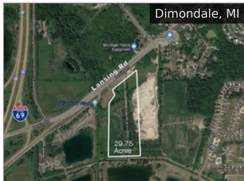
Lansing Rd $30,000 / acre