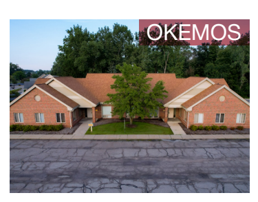
2465 Woodlake Circle 7,218 SF for Lease $15.00 SF/yr (MG)