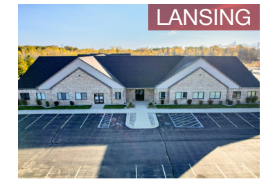
8164 Executive Ct. 7,635 SF for Lease $15.50 SF/yr (MG)