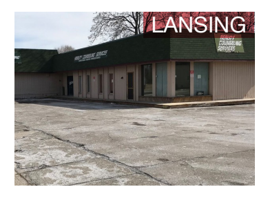
610 E. Cesar E. Chavez Ave 5,622 SF for Sale $250,000