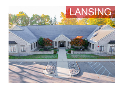
6639 Centurion Dr. 1,535 - 1,672 SF for Lease $16.00 SF/yr (MG)