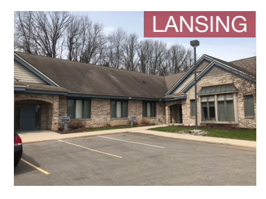
912 Centennial Way 2,110 SF for Lease $16.00 SF/yr (MG)