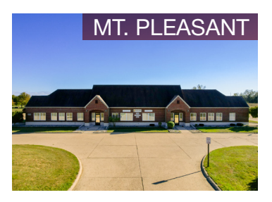
2480 W. Campus Dr. 4,264 - 8,564 SF for Lease $10.00 SF/yr (NNN)