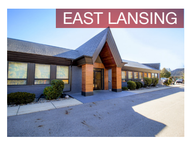
139 W. Lake Lansing Rd. 3,003 SF for Lease $13.75 SF/yr (MG)