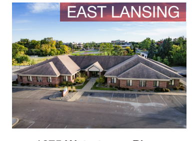
1675 Watertower Place 2,611 - 2,661 SF for Lease $15.00 SF/yr (MG)