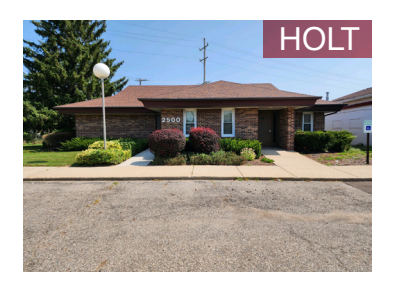
2500 N. Cedar St. 1,902 SF for Lease $15.00 SF/yr (MG)