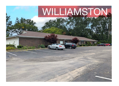
1210 E. Grand River Ave. 3,000 SF for Lease $1,950/month (NNN)