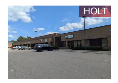
2450 Delhi Commerce Dr. 2,028 SF for Lease $12.00 SF/yr (MG)