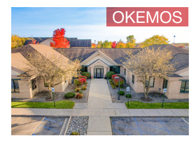
2211 Association Dr. 2,970 SF for Lease $15.00 SF/yr (MG)