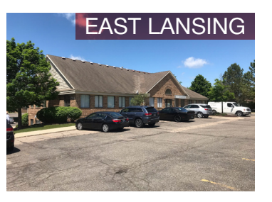
2035 W. Lake Lansing Rd. 665 SF for Lease $14.50 SF/yr (MG)