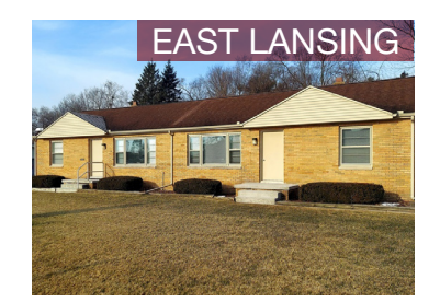
5095 E. Brookfield 3,000 SF for Sale/ 813 SF for Lease $239,000 | $900/month (MG)