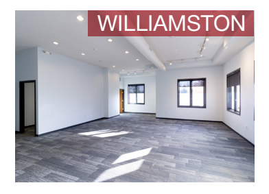
301 Williamston Center Rd. 2,166 SF for Sale $259,000

4265 Okemos Rd 1,958 SF for Sale $289,900