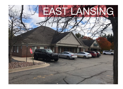
740 W. Lake Lansing Rd. 1,738 SF for Lease $15.00 SF/yr (MG)