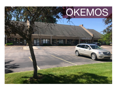
2395 Jolly Rd. 2,796 SF for Lease $15.00 SF/yr (MG)