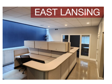
1401 E. Lansing Dr. 1,000 SF for Sale/Lease $135,000 | $1,400/month (MG)