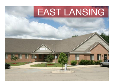
315 W. Lake Lansing Rd. 1,618 - 2,579 SF for Lease $15.00 SF/yr (MG)