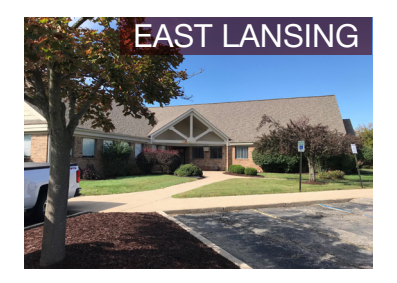
221 W. Lake Lansing Rd. 2,284 - 3,927 SF for Lease $15.75 SF/yr (MG)