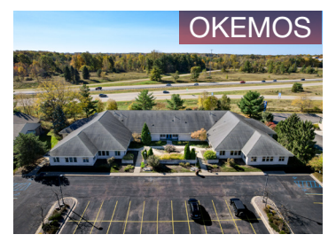
2175 University Park Dr. 14,954 SF for Sale/Lease Negotiable | $15.00 SF/yr (MG)