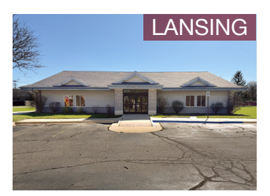
632 N. Dibble Ave 5,192 SF for Lease $13.00 SF/yr (MG)