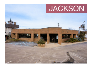
110 First St. 9,962 SF for Sale $1,100,000