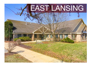
2025 Abbot Rd 4,950 SF for Lease $17.00 SF/yr (MG)