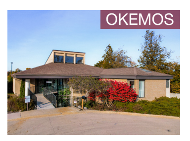
4084 Okemos Rd 3,150 - 6,950 SF for Sale/Lease $695,000 | $13.50 SF/yr (MG)