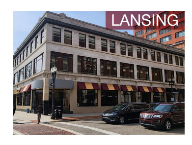
200 S. Washington Sq. 2,000 SF for Lease $15.00 SF/yr (Gross)