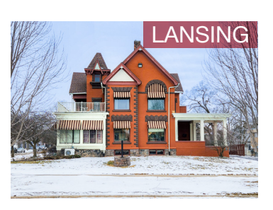
1003 N. Washington Ave. 4,407 SF for Sale/Lease $399,000 | $14.00 SF/yr (NNN)