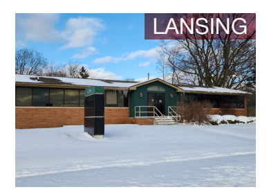
3526 W. Saginaw Hwy. 2,706 SF for Sale $445,000