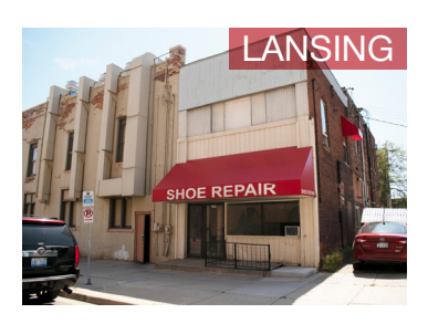
109 W. Kalamazoo St. 900 SF for Sale/Lease $105,900 | $10.00 SF/yr (MG)