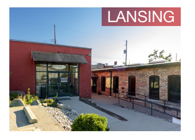
1213 Center St. 5,792 - 12,981 SF for Lease $19.75 SF/yr (MG)