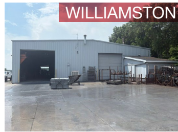
1492 E. Grand River Ave.