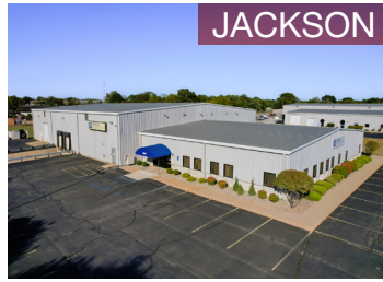
1610 E. High St.