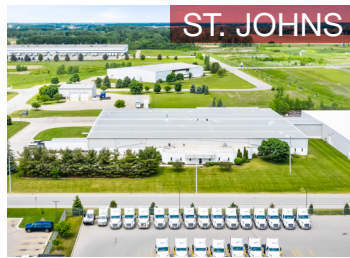
205 E. Walker Rd.