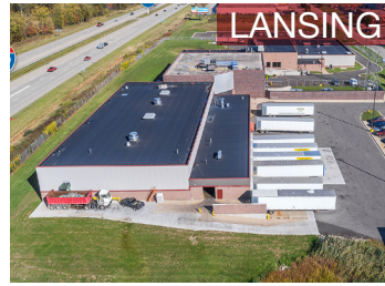
2960 Ena Dr.