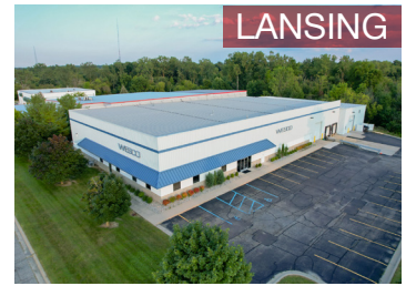
3440 Dunckel Rd.