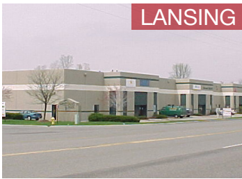
Westland Commerce Center