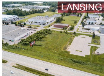
Ena Dr. 4.98 Acres for Lease Negotiable