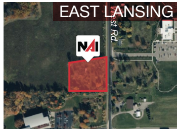
16980 West Rd. 2.4 Acres for Sale $295,000