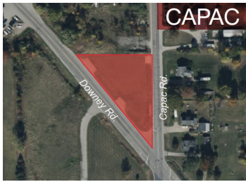
15004 Downey Rd. 0.6 Acres for Sale $59,000