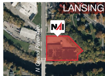
1506 N. Grand River Ave. 2.94 Acres for Sale Negotiable