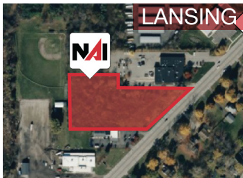
Eaton Rapids Rd. 2.6 Acres for Sale $260,000