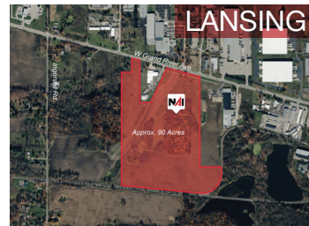
Grand River Ave. 90 Acres for Sale $4,320,000