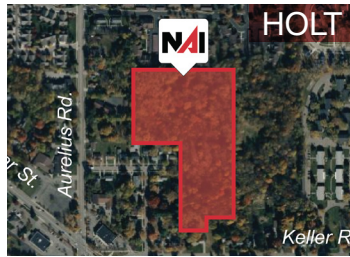
E. Norwood 12.9 Acres for Sale $99,900