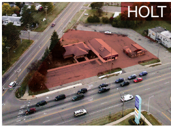
2500 N. Cedar St. 1.4 Acres for Sale $795,000