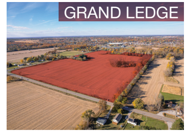
M-100/W. St. Joseph Hwy. 63.57 Acres for Sale $4,000,000