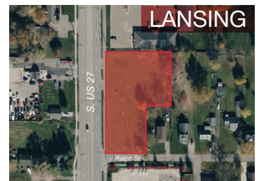
15891 S. U.S. 27 0.95 Acres for Sale $79,900