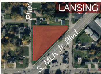
S. MLK Jr. Blvd. 1.2 Acres for Sale $169,000