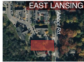
2005 Abbot Rd. 0.33 Acres for Sale Negotiable