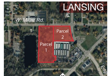
Miller Rd. 7.65 Acres for Sale $259,000