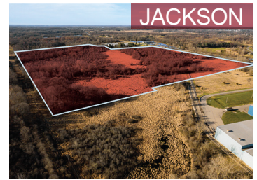
S. Meridian Rd. 103 Acres for Sale Negotiable